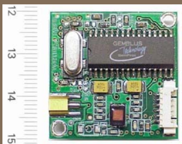
Prox - Module