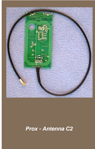
Prox - Antenna C2